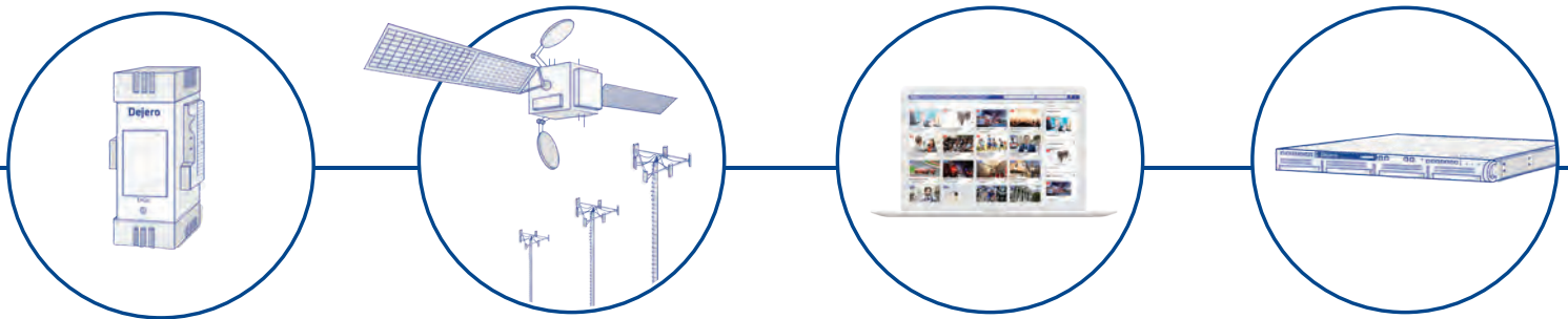
Dejero transmitter with Core software

A vehicle equipped with a satellite antenna was not an option for this event, given the constraints of the Windsor location. With the ability to use a portable fly-away antenna, the CellSat solution demonstrated its versatility to Global TV.