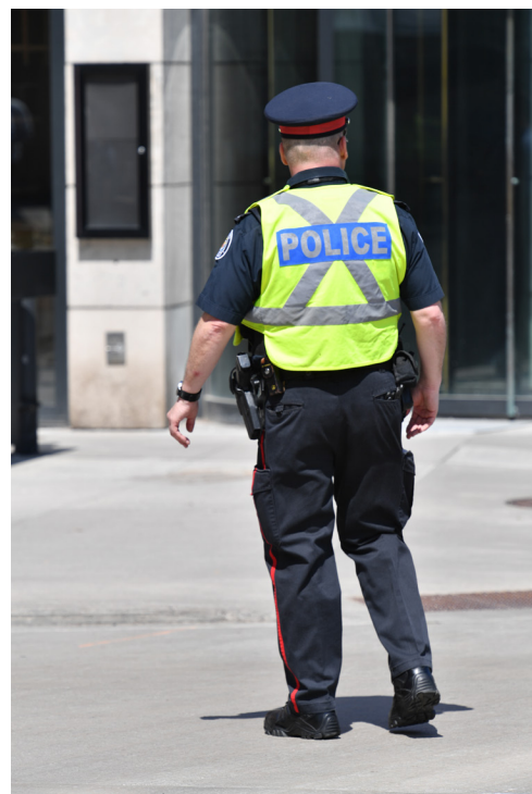
The Dejero system has enabled the Toronto Police Service to maintain real time data across hundreds of kilometers and between multiple Command Centers.

In one particular deployment, the Dejero solution consistently outperformed other police agencies' systems, allowing multiple police departments to effectively coordinate public safety protocols across long distances.