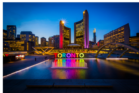
During protests, rallies and major public events Toronto Police relies on Dejero to ensure information is being transmitted under any condition in real-time.

“The Dejero Gateway will give us enhanced capability. Relying on single SIM and single-source network providers means that connectivity can be lost, prone to dead zones and saturation of cell towers. The ability to connect to central systems remotely and reliably is vital for all kinds of policing,” says Snea.