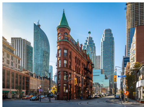
Toronto hosts a wide variety of events, from concentrated professional sporting events like the Raptors basketball and Maple Leafs hockey teams, to wide-area public events like the Toronto Marathon, Pride Toronto and Rolling Loud.

Made with lightweight, aircraft-grade aluminum, the EnGo transmitter's rugged design is tough and lightweight for demanding field use. EnGo units are certified by leading regulatory, industry, and mobile network operators and offer AES-256 encryption security for data transfer over public internet links. The EnGo transmitter's dynamic routing of packets over multiple connections provides public safety agencies with secure, fast, and prioritized network access.