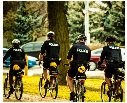
The Toronto Police Service's Emergency Management and Public Order unit is responsible for public safety and situational management, as well as search management, public order and explosive disposal.

Furthermore, the use of RPAS to deliver live high-definition video feeds is extremely bandwidth-intensive — even a partial signal failure can render a unit useless.